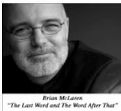
Brian McLaren "The Last Word and The Word After That"

That's right. Just two more days until Brian pays us a visit to talk about his new book, The Last Word and The Word After That. He'll be interested in hearing what you think of the book and will be hanging around to interact and answer any questions you might post.